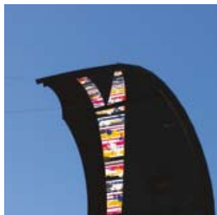
Low friction rings on bridle